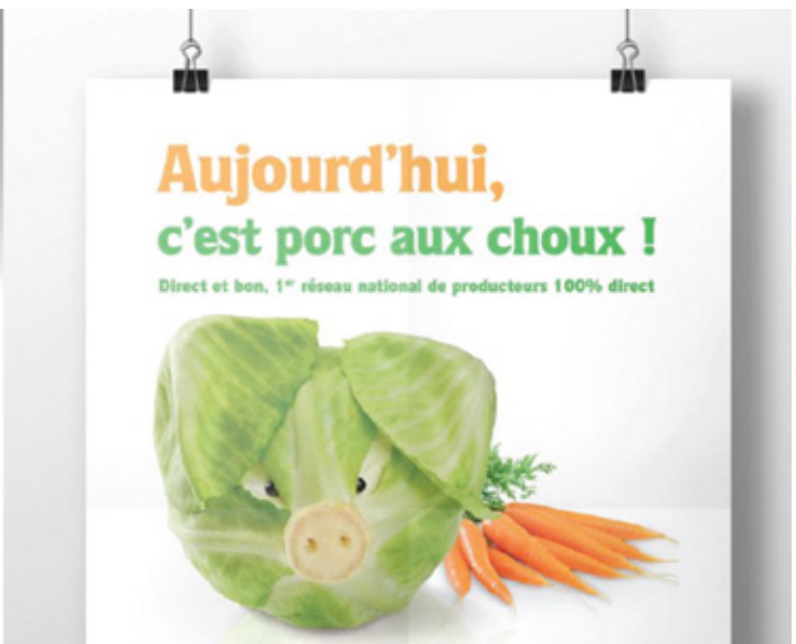
Advertising Campaign Banque Populaire